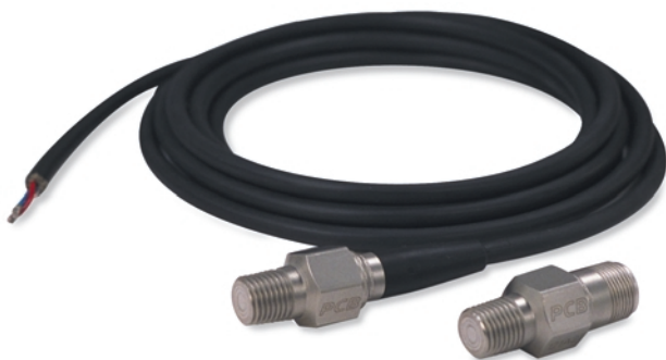
Series 121 Industrial Dynamic ICP ® Pressure Sensors

Piezoelectric pressure sensors offer the unique ability to respond to very rapid pressure spikes, pulsations and surges. They can also sense minute pressure fluctuations while being subjected to very high static pressures. The Series 121 Industrial Dynamic ICP ® Pressure Sensors satisfy such measurement requirements in monitoring, diagnostic, troubleshooting, and control applications in harsh, factory environments. Applications include: leak detection; locating sources of damaging water hammer and cavitation; troubleshooting pulsations in liquid delivery systems; and fine tuning pumping system and valve behavior to improve efficiencies and reduce maintenance.