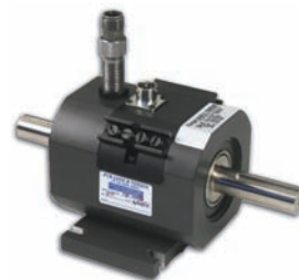
Series 3123, 3124 & 3125