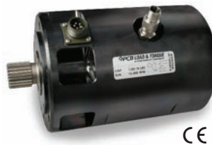
Series 4115A & 4115K

We offer a full line of rotary transformer torque sensors to meet a wide variety of testing needs. Our capacity ranges are shown in the table (right).