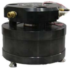
Air Bearing Shaker

The Models K394A30 and K394A31 Calibration Shaker Systems represent a new level of performance in calibration grade shakers. As the centerpiece of these systems, the 396C10 and 396C11 air bearing shakers continue the award winning PCB Group tradition of providing superior performance characteristics and ease of use while offering exceptional value and simplicity. A graphite air bearing combined with an ultra-stiff lightweight armature essentially eliminates transverse motion that plagues traditional flexure based shaker armature suspension systems.